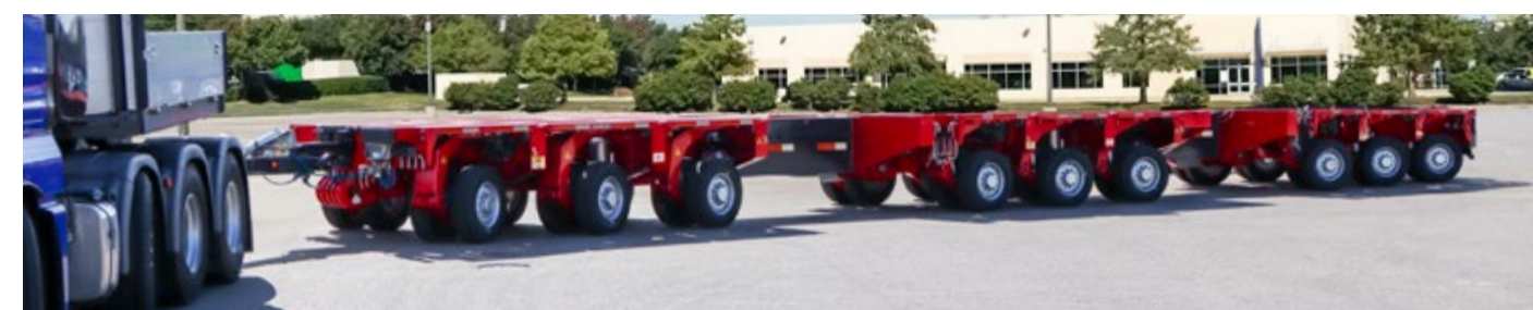
DRAWBAR COMBINATION Combination with intermediate and rear bogies for even bigger flexibility.